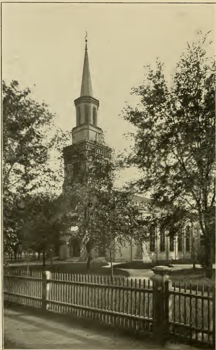
FIRST PRESBYTERIAN CHURCH, AUGUSTA, GA.